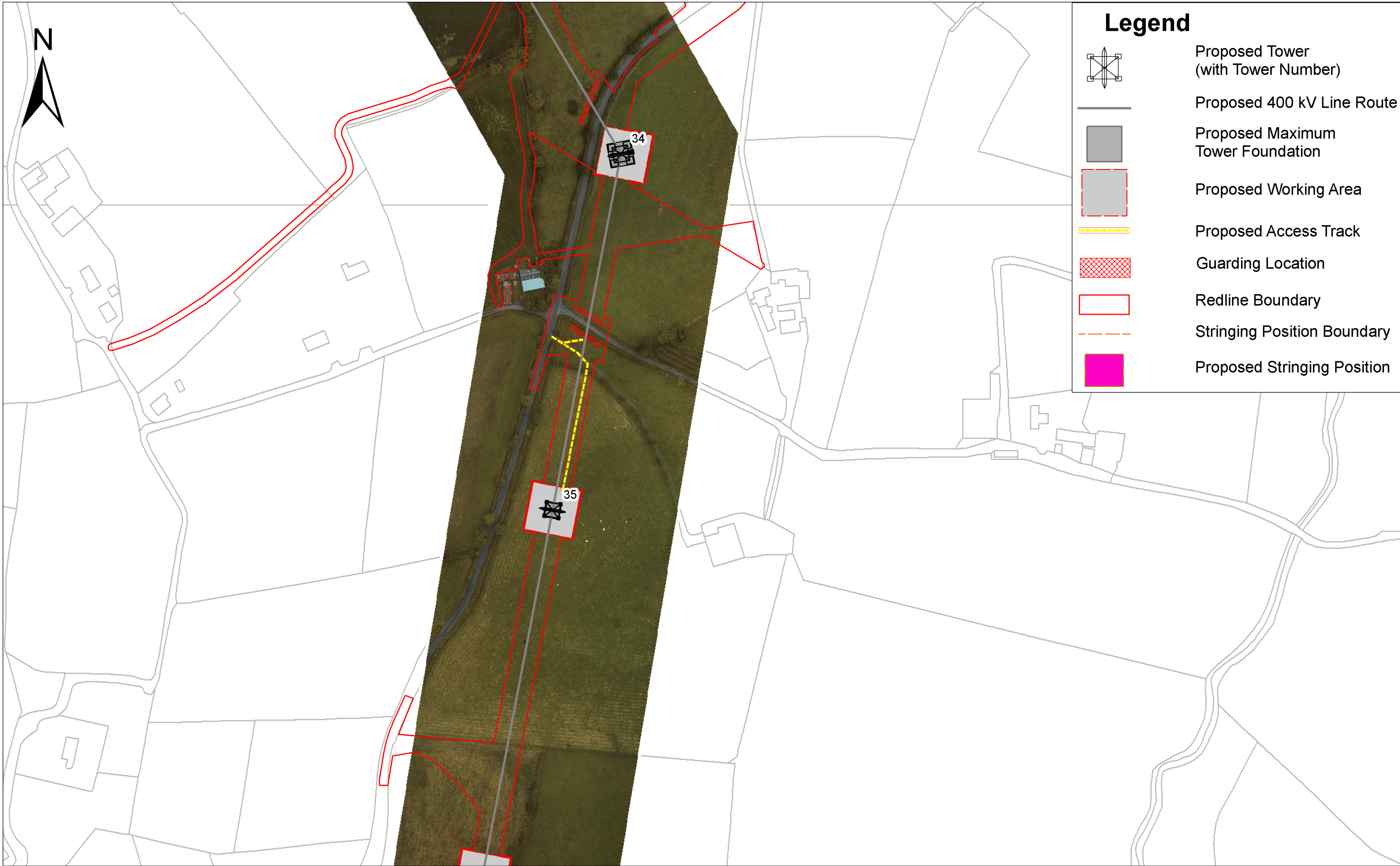
View 1: 1/2,500